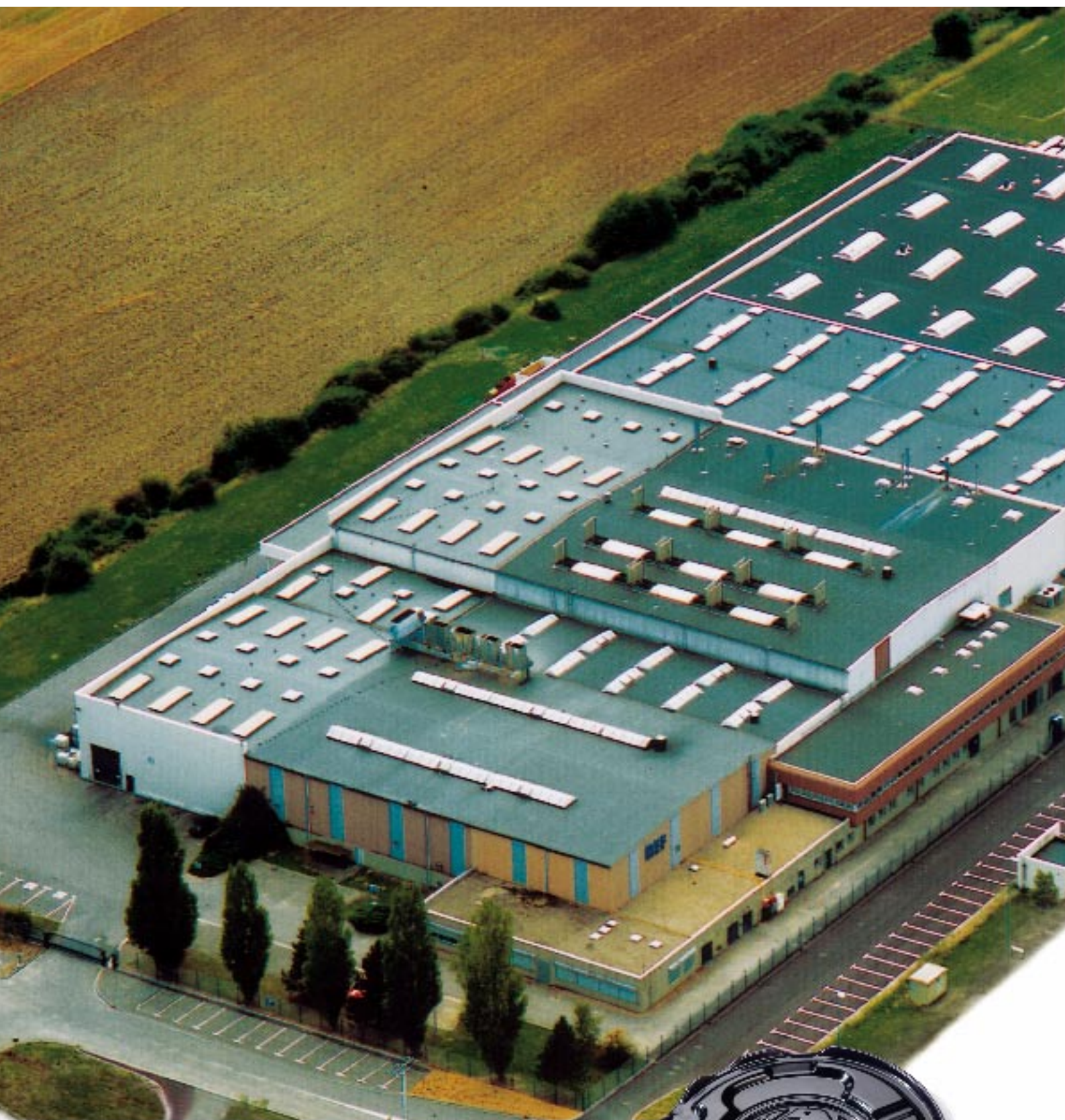
AEF - Ateliers d'Emboutissage de Faulquemont – a modern production facility for the manufacture of high-quality pressed parts and components for the automobile industry and its suppliers.