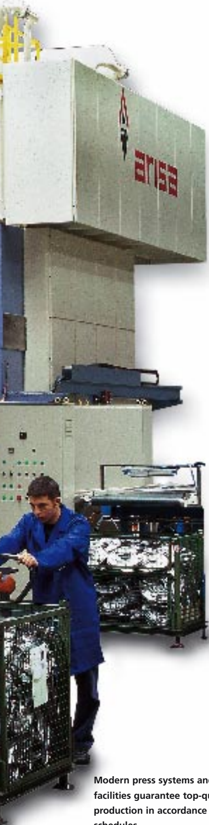
Modern press systems and assembly facilities guarantee top-quality production in accordance with customer schedules.