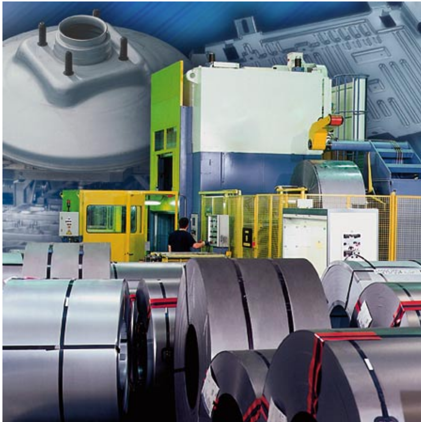
AEF Ateliers d'Emboutissage de Faulquemont S.à.r.l.